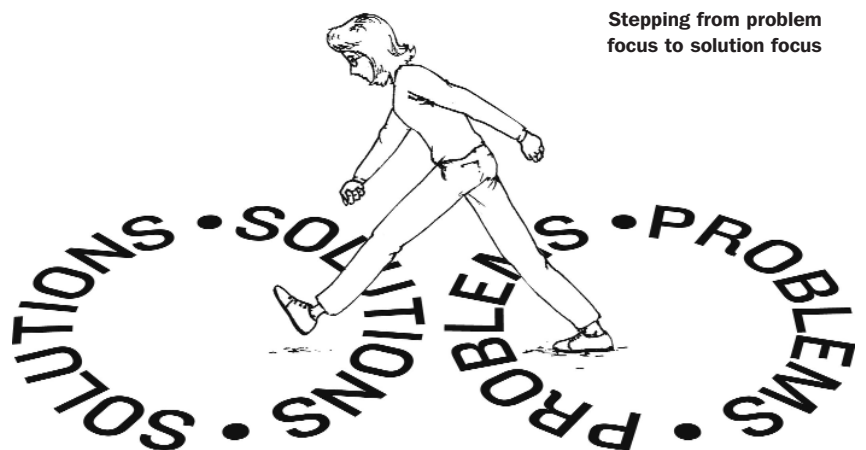
Stepping from problem focus to solution focus